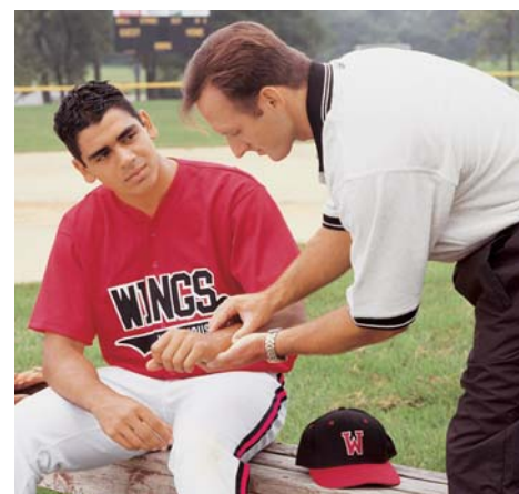
– Minor Sports Injuries